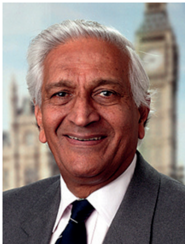
Prof Lord Patel KT

One of the last things Lord Walton did as patron was to recruit his successor and we are delighted that Lord Patel agreed to take over the post. Like Lord Walton Lord Patel is a distinguished medical practitioner having spent his career as a consultant obstetrician in