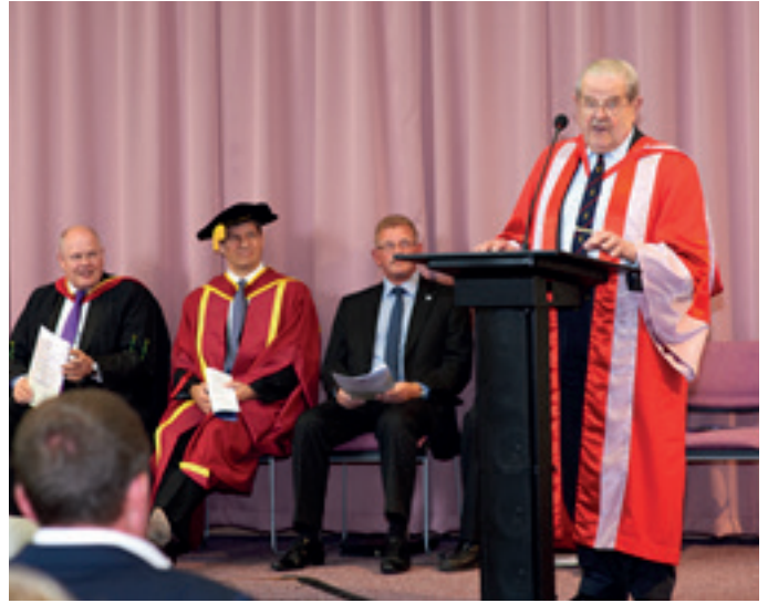
Lord Walton addressing the graduates at the 2012 Graduation Ceremony'