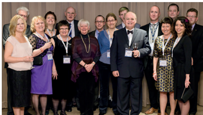
Some of our Official Supporters